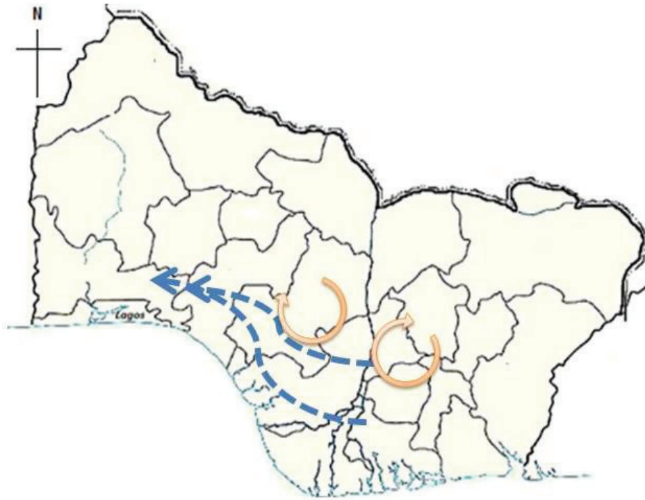
Figure 3. Southern Nigeria (Study area) with the direction of spread of the large fruit size Westward ——— and the restricted movement of the small sized fruit ———